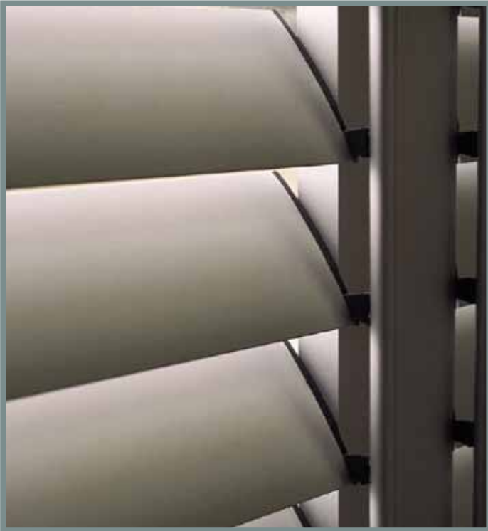
A unique swivel designed side-mounted tilt bar guarantees smooth responsive control.