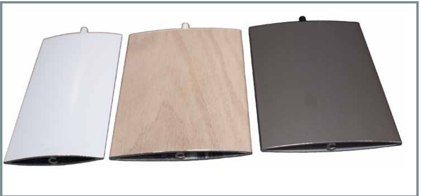
The reinforced louvers are engineered to allow for wider and taller panel capabilities while still maintaining a refined, contoured shape, providing an unimpeded view.