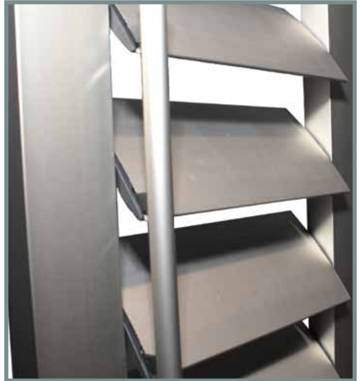
Ergonomically designed to create refined lines with a light-omitting fit.